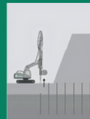
Vertical wick drains