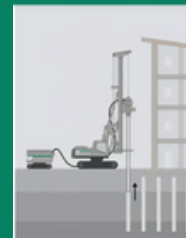
Rigid concrete inclusions