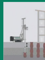
Vibro stone columns