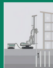
Rigid concrete inclusions